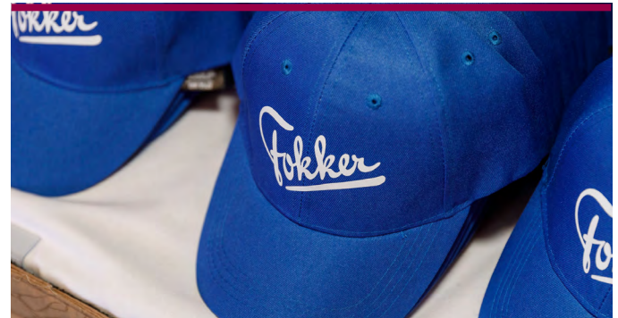
⚡ Hats: $3,750*

Production costs for branded items included in package price.