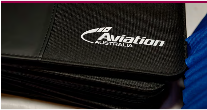
⚡ Folios: $5,250*