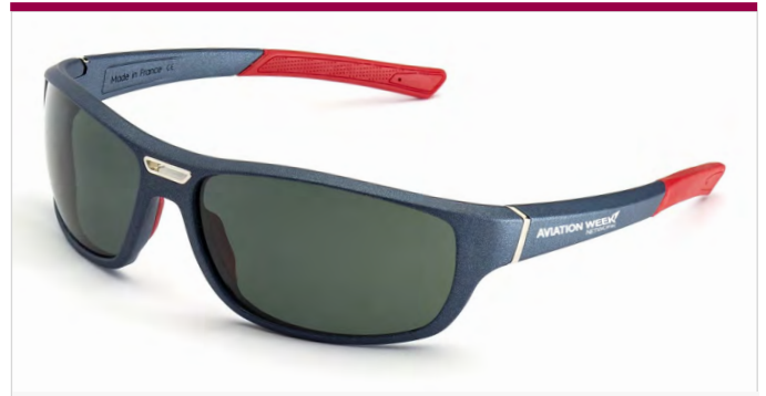
⚡ Sunglasses or Sunglasses Case: $4,000*