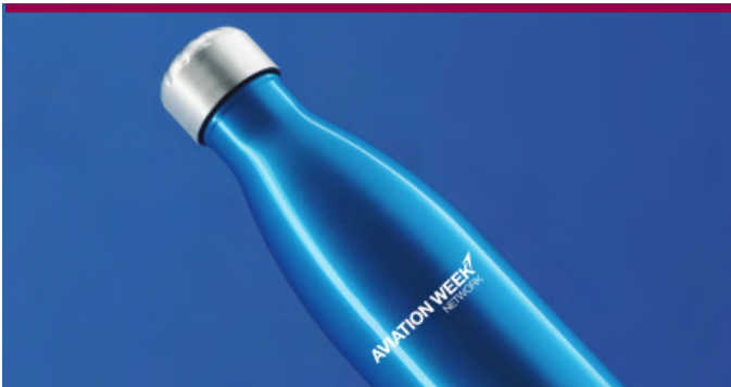
⚡ Water Bottles: $3,750*