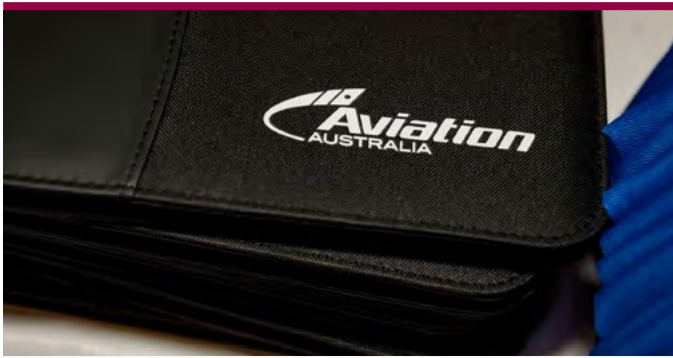
⚡ Folios: $5,250*